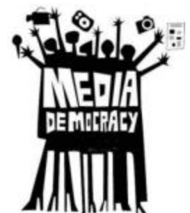
Media play an important role in shaping the public opinion