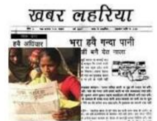
Khabar lahariya has played an important role in highlighting the local issues in the Chitrakoot District of Uttar Pradesh