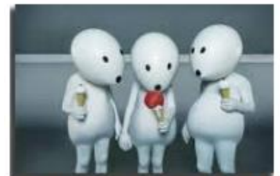
Advertisements are a major source of earning for the media